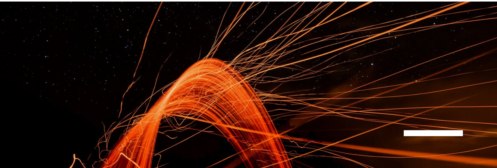
MyFREJA shipment dimension